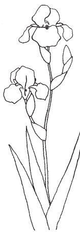
TB over 27½" tall Page 0–51