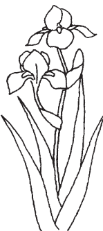
IB 16 – 27½" tall Page 60–61