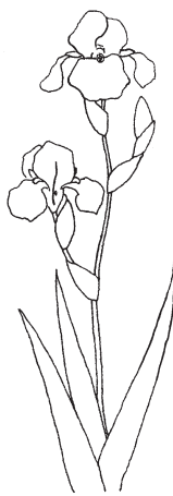
TB over 27½" tall Page 1–40