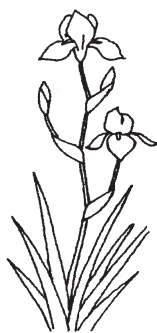
MTB 16 – 27½" tall Page 45–46