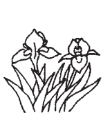
MDB up to 8" tall Page 54–55

Plicata – Stippled, stitched, dotted or lined pattern on a different / paler ground color