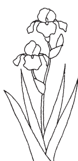
BB 16 – 27½" tall Page 45